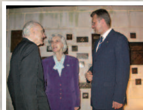
Friends of Slovakia Wall of Honor

The FOS Wall of Honor in the garden of the Slovak Embassy provides a prominent place for individuals, companies and organizations to be recognized for their commitment to US-Slovak friendship. Many donors choose the Wall to honor their ancestry, heritage or interest in Slovakia with a bronze plaque. FOS honors plaque donors during a yearly reception at the Slovak Embassy. Sample plaque pricing for individual donors: